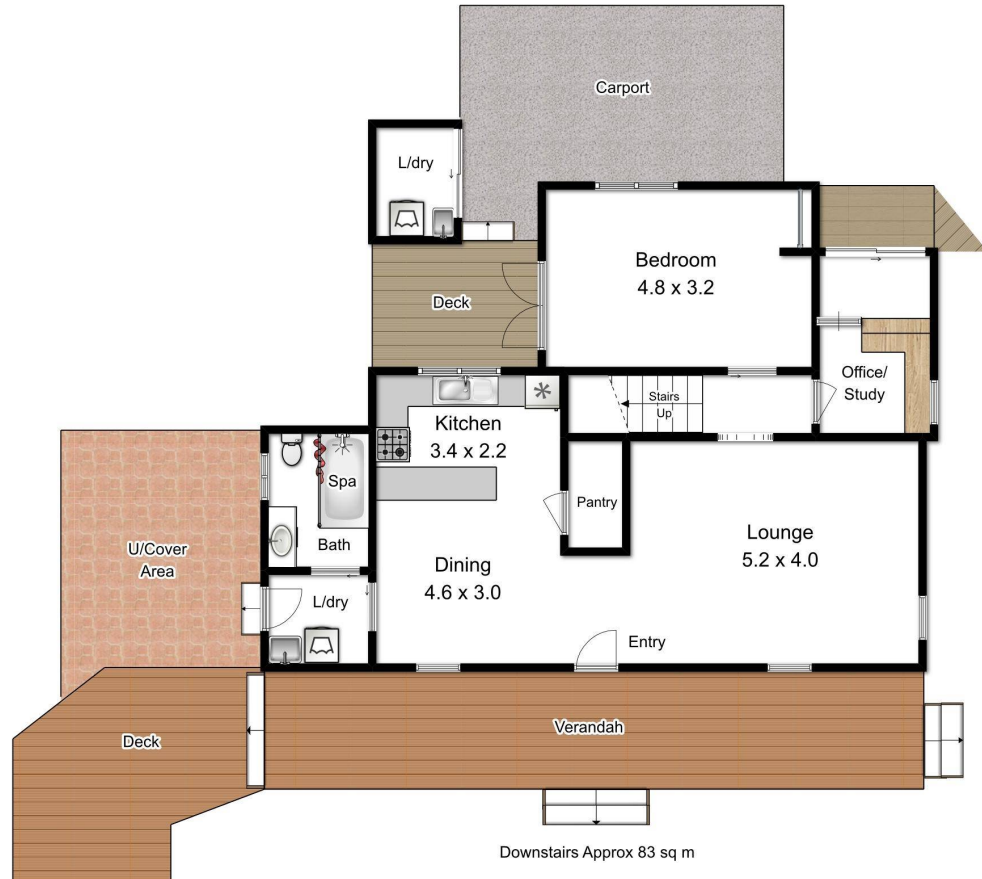
Downstairs Approx 83 sq m