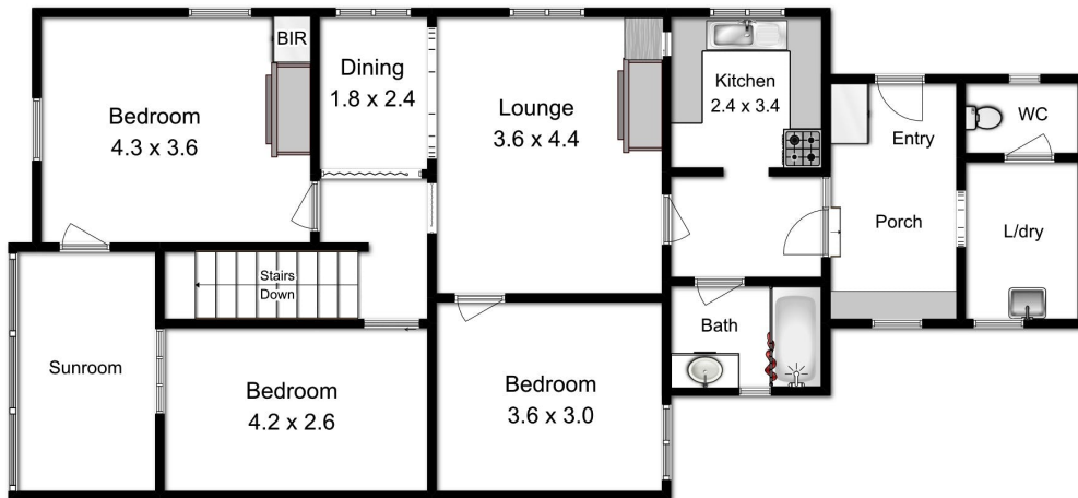
Upstairs Approx 111 sq m