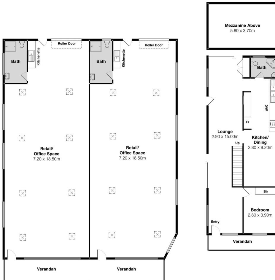
24-24A North Terrace, Port Elliot

Scale in metres. This drawing is for illustration purposes only. All measurements are approximate and details intended to be relied upon should be independently verified.