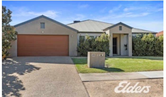
10 LEANT DRIVE, THURGOOD