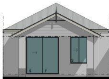
PUBLIC OPEN SPACE ELEVATION 1:100