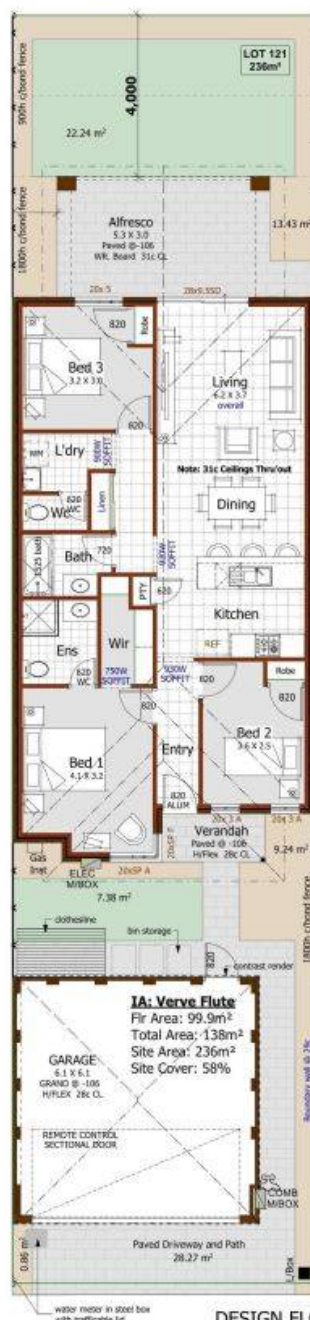
DESIGN FLOOR PLAN 1:100