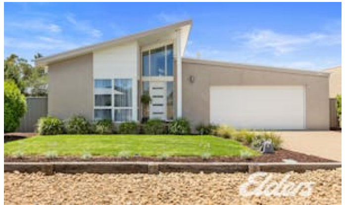
100 LARRAKIE ST, WARRAWONGA NSW