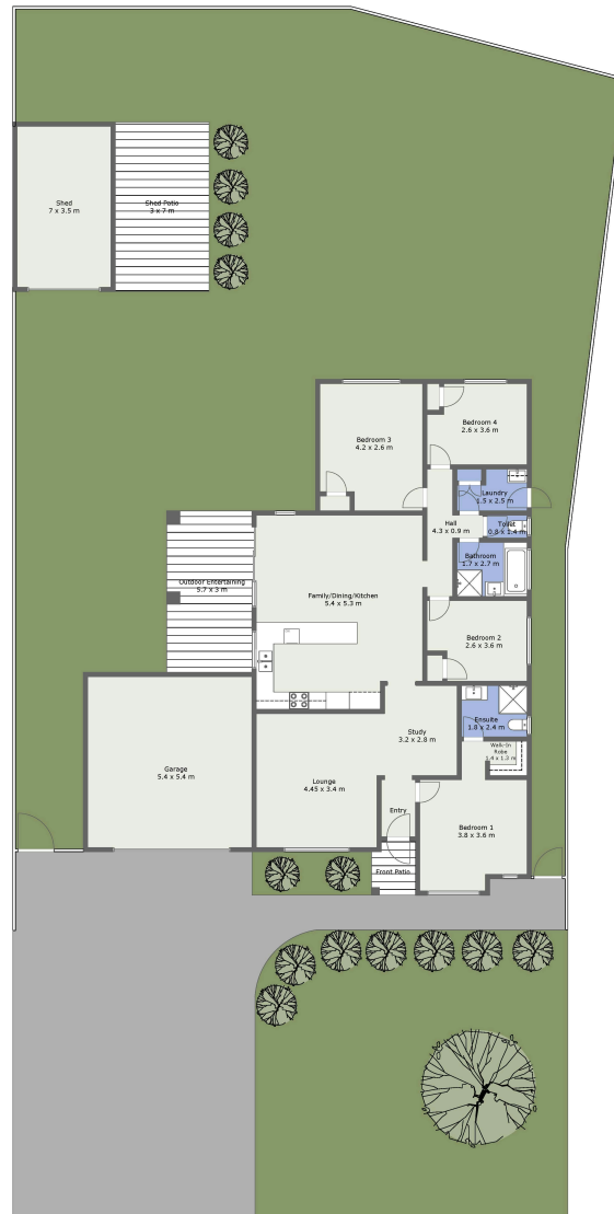
Site Plan / Ground Floor