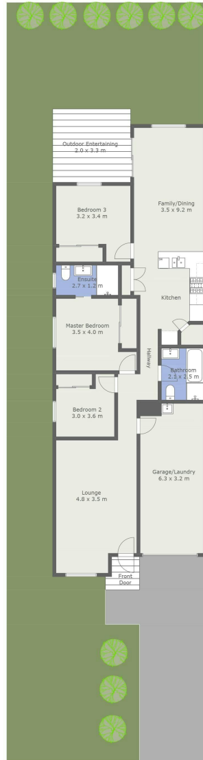
Site Plan / Ground Floor