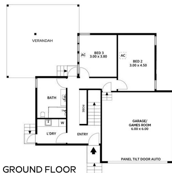
Villa 5 South Shores, Normanville

Scale in metres. This drawing is for illustration purposes only. All measurements are approximate and details intended to be relied upon should be independently verified.