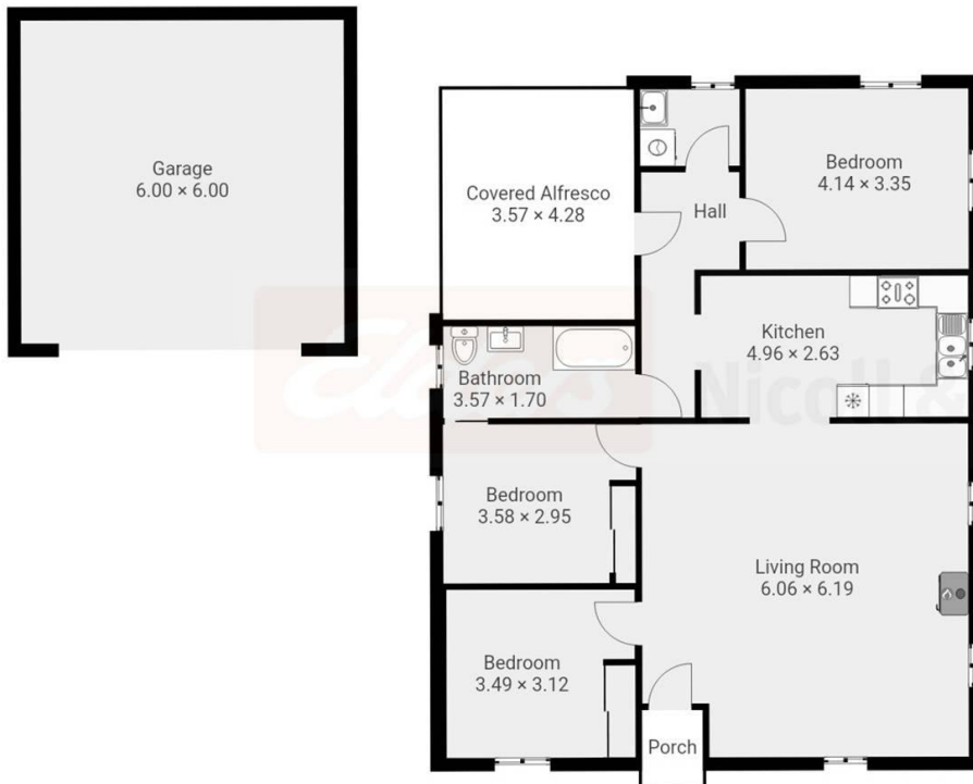
Residential Home 64 Govett St, Katoomba Floorplan