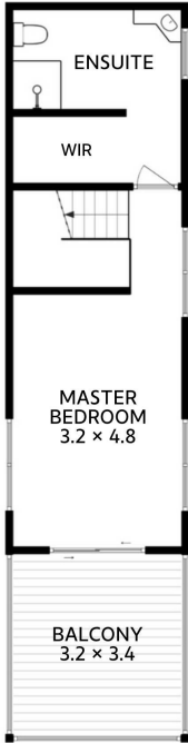
Upstairs Approx. 44 sq m

Approx. Total Floor Area 149 sq m (excluding patio and garage)