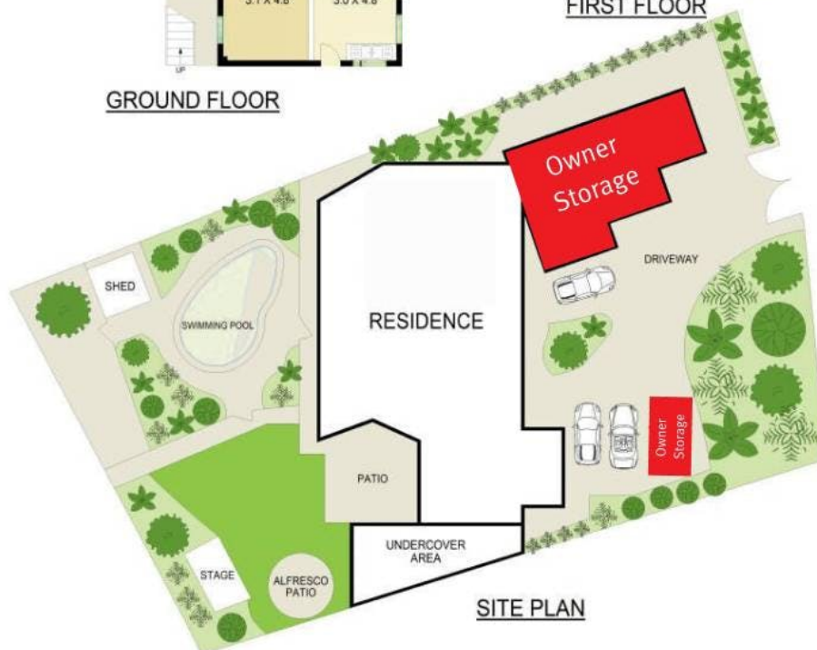
9 Kingston Place, Rapid Creek