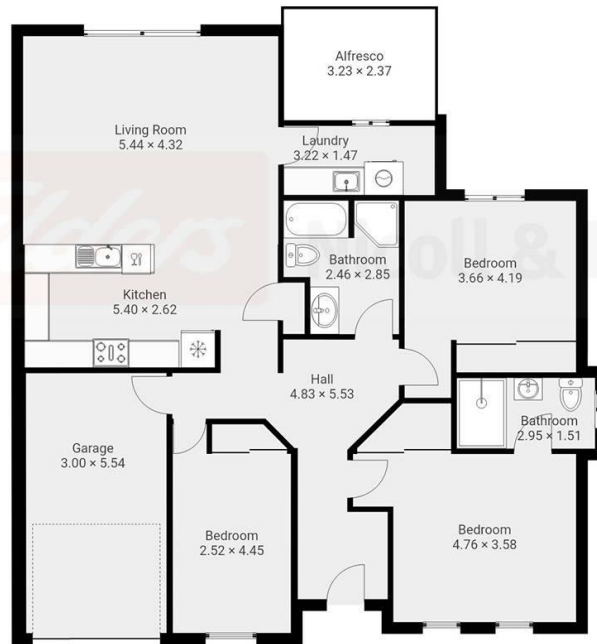
6/55 Brilliant Street, Bathurst Floorplan

Disclaimer: Floor plan dimensions are approximate. Indicative only. All information contained herein is gathered from sources we believe to be reliable, however, are to be used as a guide only. We cannot guarantee its accuracy and interested persons should rely on their own enquiries.