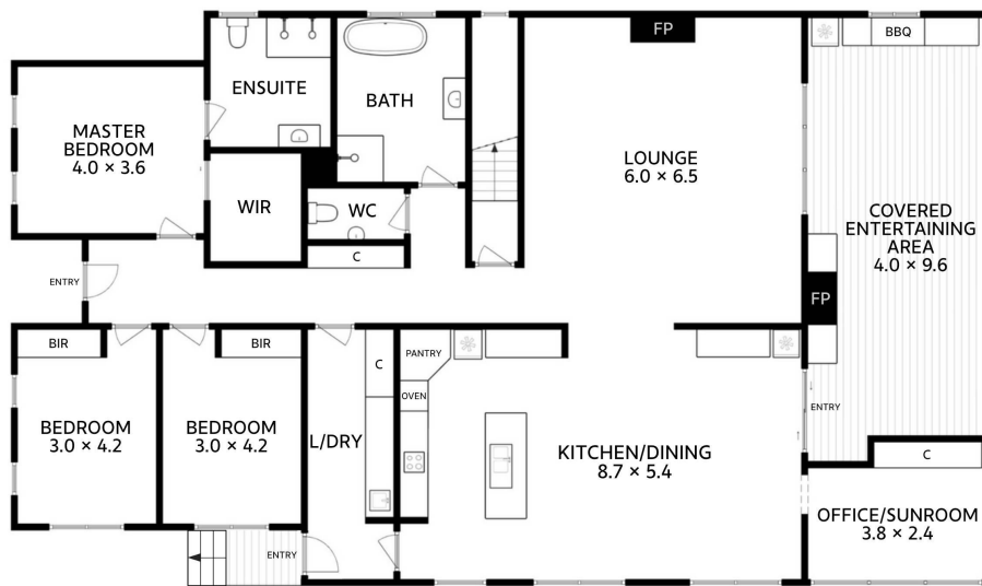
Upstairs Approx. 240 sq m