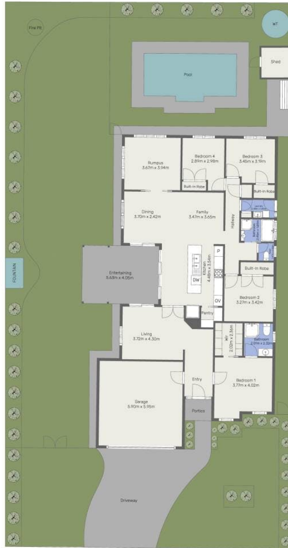
Site Plan / Ground Floor