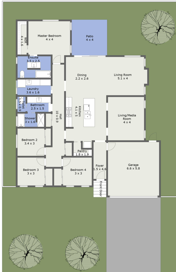
Site Plan / Ground Floor