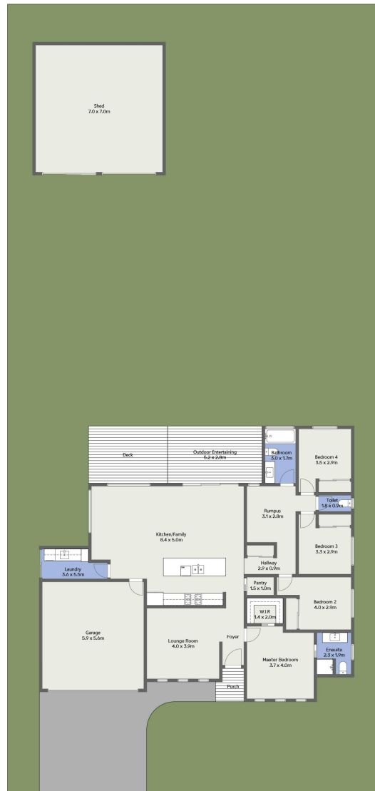
Site Plan / Ground Floor