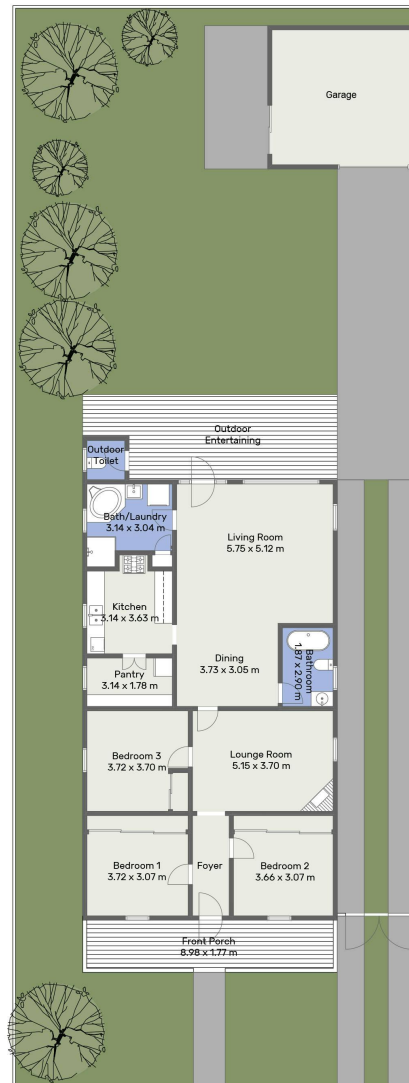
Site Plan / Ground Floor