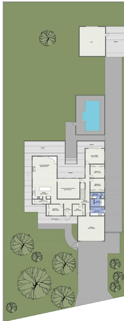
Site Plan / Ground Floor