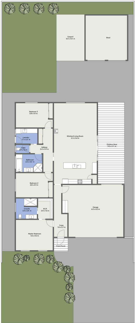
Site Plan / Ground Floor