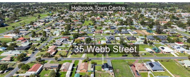
Holbrook Town Centre