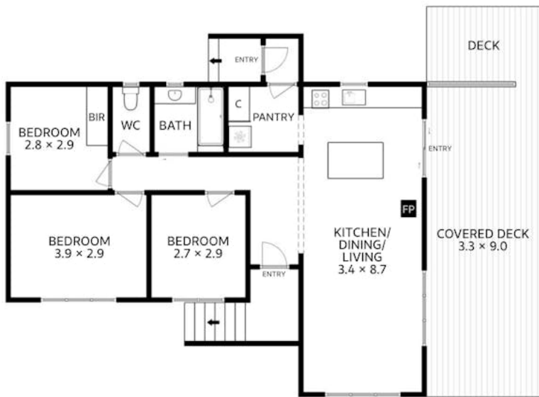
Upstairs Approx. 80 sq m