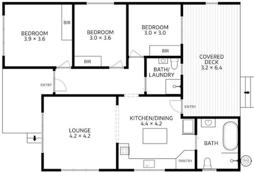
Approx. Floor Area 100 sq m (excluding covered deck and garage/workshop)