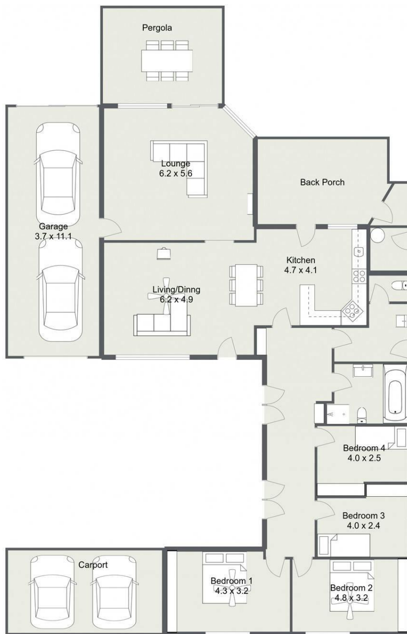
THIS FLOOR PLAN IS FOR ILLUSTRATION PURPOSES ONLY