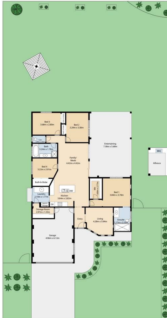
Site Plan / Ground Floor