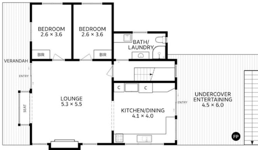
Upstairs Approx. 82 sq m