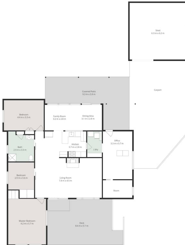
Sizes And Dimentions Are Approximate, Actual May Vary