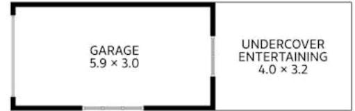
Approx. Floor Area 148 sq m (excluding porch, garage and undercover entertaining)

All measurements are internal and approximate. This plan is a sketch for illustration, not valuation.