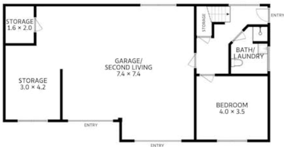
Downstairs Approx. 107 sq m