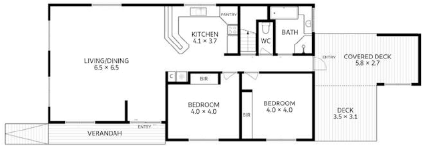
Upstairs Approx. 107 sq m

Approx. Total Floor Area 214 sq m (excluding verandah, covered deck and deck)