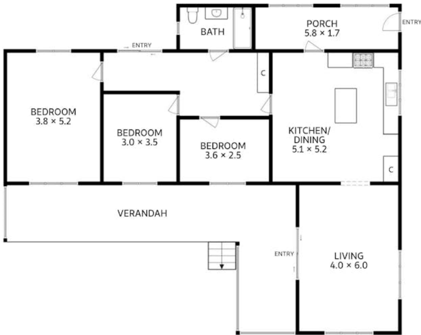
Approx. Floor Area 115 sq m (excluding verandah, carport and shed/entertaining)