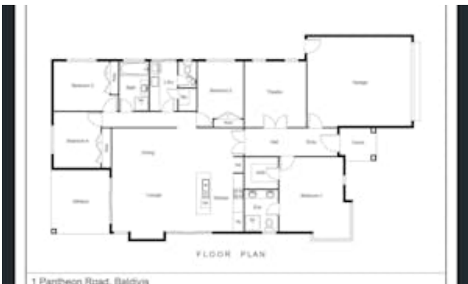
1 Parthenon Ritzcl. Baldivia