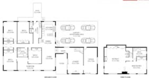
120 - 130 WINDSOR STREET, WOODFORD