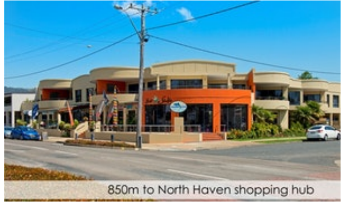
850m to North Haven shopping hub