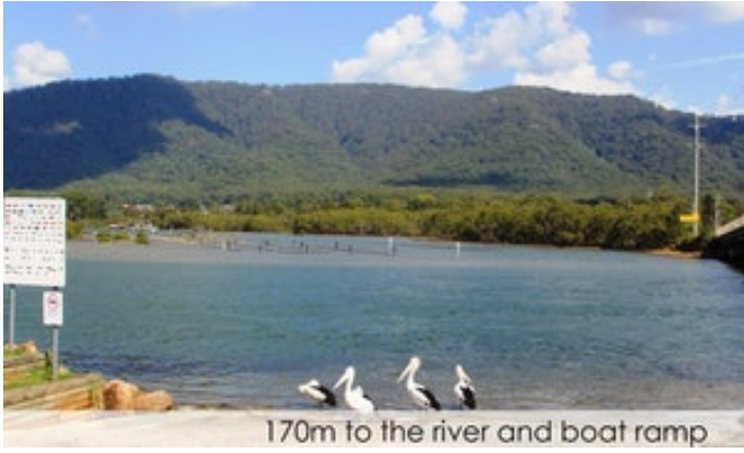
170m to the river and boat ramp