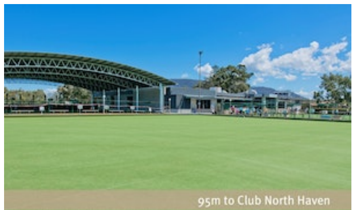
95m to Club North Haven