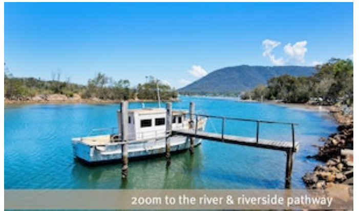
zoom to the river & riverside pathway