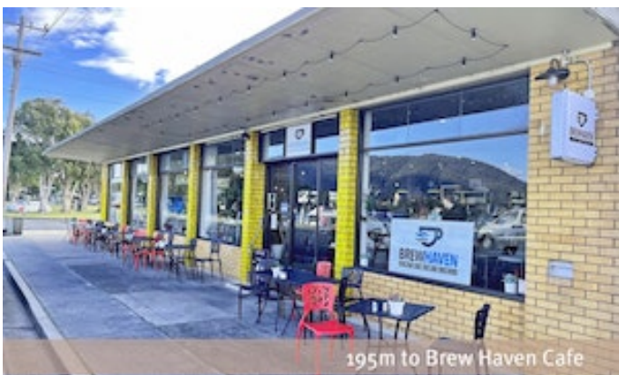
195m to Brew Haven Cafe