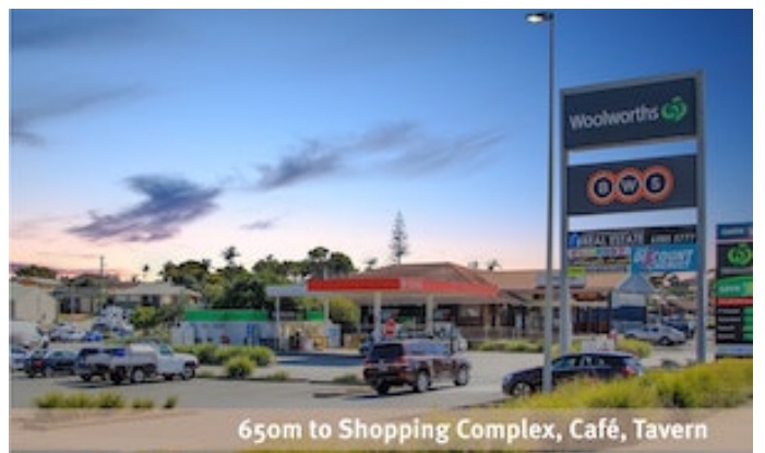
650m to Shopping Complex, Café, Tavern