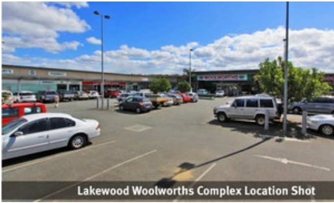
Lakewood Woolworths Complex Location Shot