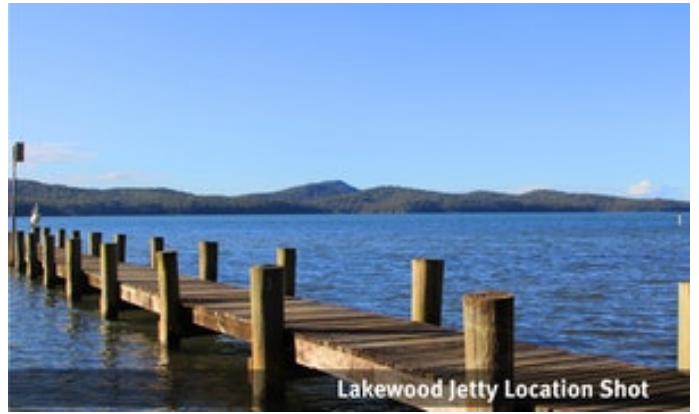
Lakewood Jetty Location Shot