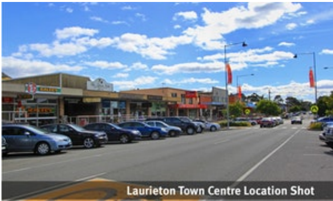
Laurieton Town Centre Location Shot