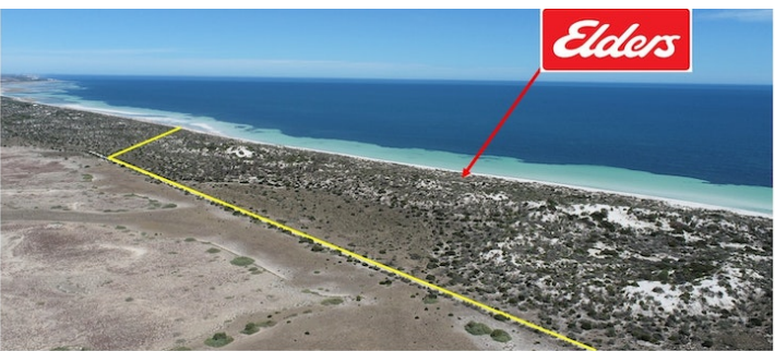
Lot 6 Conservation Road, WAURALTEE, SA 5573