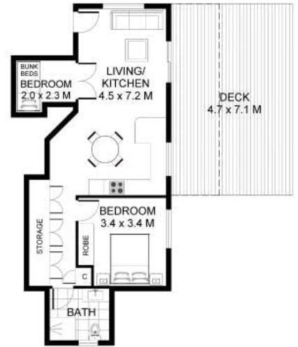
LOWER LEVEL STUDIO