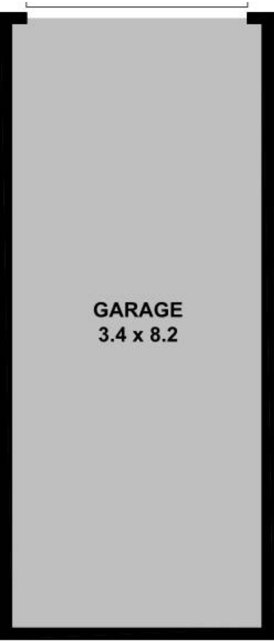
NOT IN CORRECT POSITION