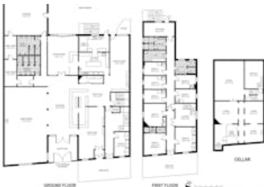
58 Main Street,

Scale in meters, indicating only. Dimensions are approximate. All information is provided as a guide only and is not to be relied upon for any purpose.