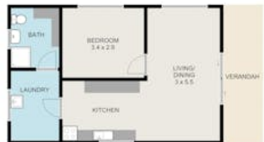
2 Koala Road (Second Dwelling) Jeeralang Junction