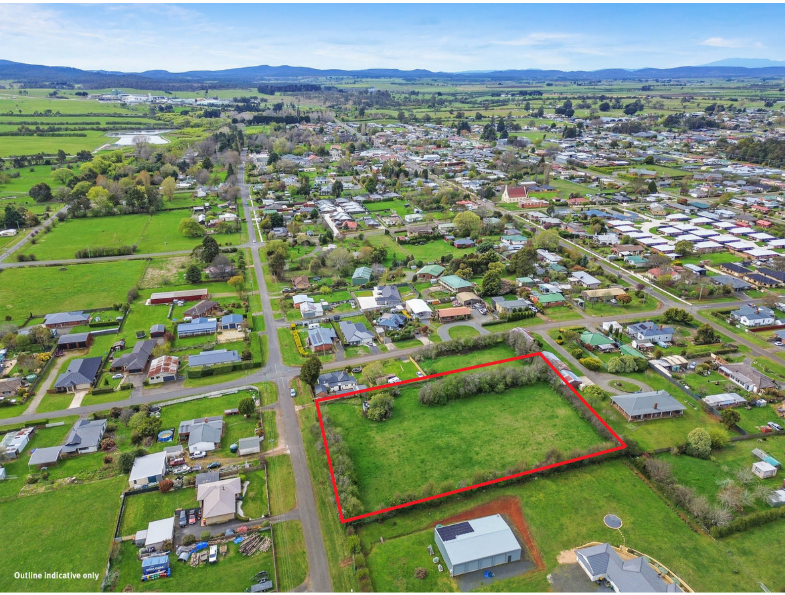
Outline indicative only