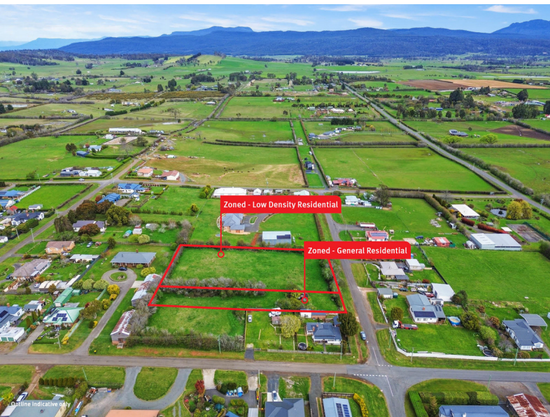
Outline indicative only