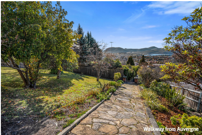
Walkway from Auvergne