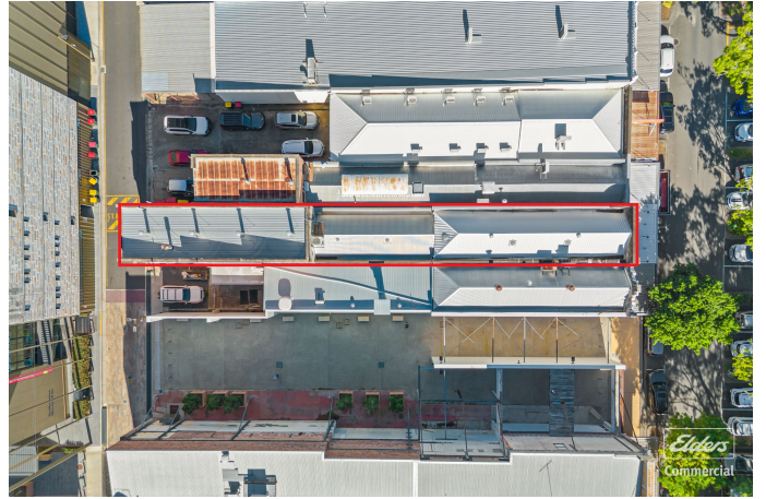
123 East Street, Rockhampton